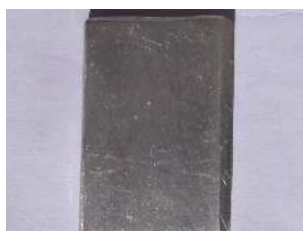
Figure 3 photo for Aluminum alloy after immersion in Gabraun water