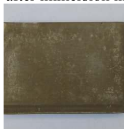
Figure 4 photo for Aluminum alloy after immersion in Desalination water

Furthermore the color of the Gabraun water and Desalination water didn't change until the end of the experiments which remained colorless. In addition, after one week from the immersion, it was seen that the level of the water in each beaker was decreased about 50 ml, this lack of the water was attributed to change of the temperature from 25°C to 37°C and this lack of water was substituted continuously until the end of the experiments.